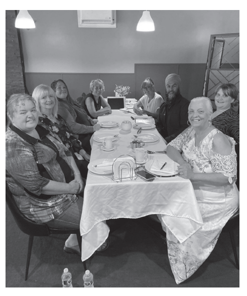
Continued from front page...

If anyone has any information about this type of activity or any other crime, please contact the OPP at 1-888-310-1122. Should you wish to remain anonymous, you may call Crime Stoppers at 1-800-222-8477 (TIPS) or submit information online at www.ontariocrimestoppers.ca where you may be eligible to receive a cash reward of up to $2000.